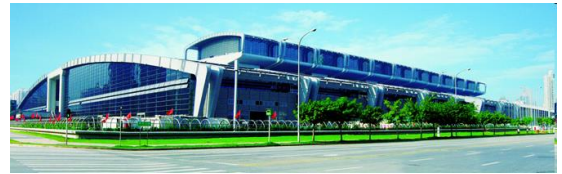
Exhibit and introductions

Location: Shenzhen Convention & Exhibition Center